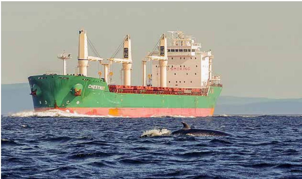
Figure 1: Vessels and whales not always get out of the way of each other.

The worldwide number of collisions has significantly increased since the 1950. During the past years, with a steep global increase of shipping traffic and increasing average travel speeds of vessels, the situation became - at least in some areas of the world – a real conservation problem, sometimes even a matter of survival for cetaceans on a population level. Whales may be hit either by the bow or the keel of a vessel, protruding parts of vessels like skegs or stabilizers, or by its propeller, leaving such nasty wounds on a live animal. Sometimes whales will be stuck on the bow of large ships and brought into the harbour. Such cases might only be recognized upon arrival at port.