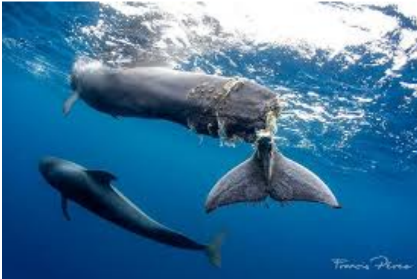
Figure 3: Short-finned pilot whale with a severed caudal peduncle due to cuts inflicted by the propeller of a small-medium sized boat. The whale was found on 24 th March 2019 within the Special Area of Conservation Teno-Rasca (SW Tenerife).