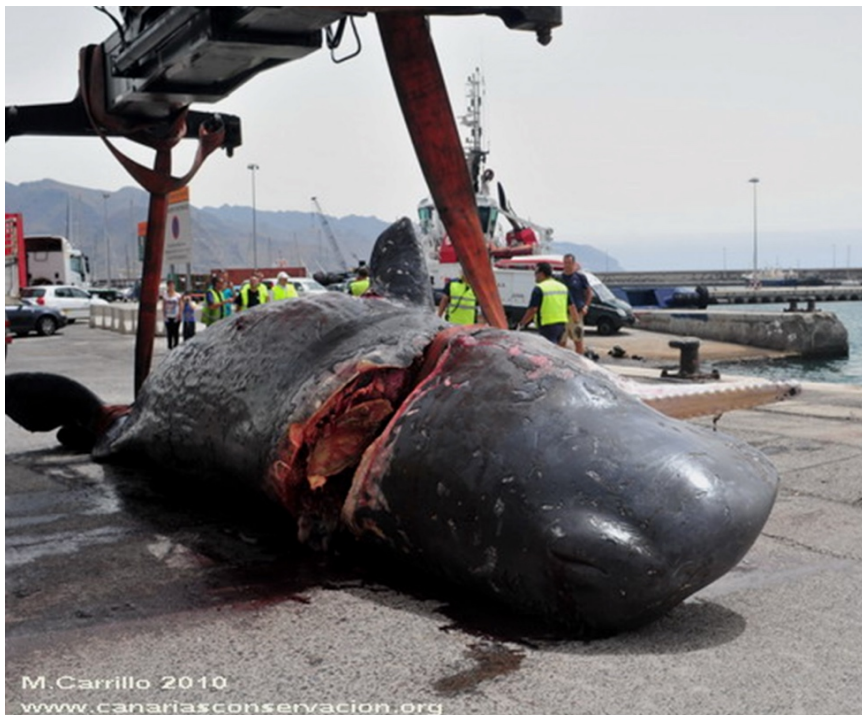
Figure 2: Carcass of a stranded sperm whale in the Canary Islands showing a typical lesion inflicted by a sharp bow like the ones of high-speed ferries operating in the Canaries.

More recently, another three whales (one Bryde's whale and two sperm whales) were found at the coastlines of Fuerteventura; Gran Canaria and Tenerife. The determination of the cause of death is still pending, but at least one of these whales carried large gashes, a typical lesion inflicted by large wave-piercing vessels. In addition, a pilot whale was found within the Nature 2000 Special Area of Conservation Teno-Rasca (SW Tenerife) with a severed caudal peduncle, the cuts were consistent with the propeller of a small-medium sized boat. This whale had to be euthanized (Figure 3). It is relevant that tag-data have shown that pilot whales have negative buoyancy once they collapse their lungs, meaning that large cuts cutting the lungs would cause these whales to sink and thus these collisions would pass unnoticed (Aguilar de Soto, 2006).