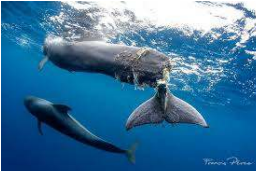
Figure 3: Short-finned pilot whale with a severed caudal peduncle due to cuts inflicted by the propeller of a small-medium sized boat. The whale was found on 24 th March 2019 within the Special Area of Conservation Teno-Rasca (SW Tenerife).